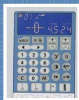
STITCH SELECTION KEYPAD