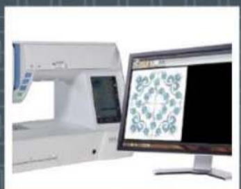
STITCH COMPOSER STITCH CREATION PROGRAM