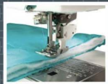
ACUFEED FLEX LAYERED FABRIC FEEDING SYSTEM