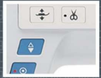
AUTOMATIC PRESSER FOOT LIFT

Optional Crafting and Home Décor, Quilting, and Fashion and Finishing kits available