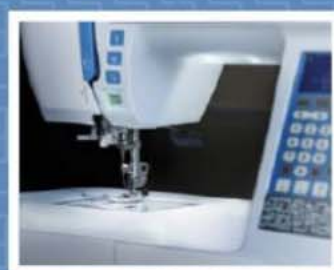
ULTRA-BRIGHT LED LIGHTS