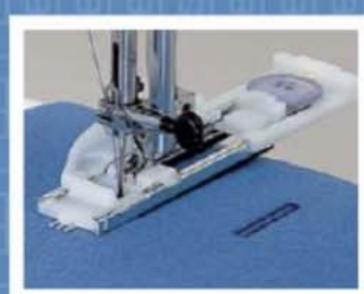
AUTOMATIC 1 STEP BUTTONHOLE