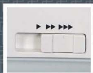
SPEED CONTROL SLIDER