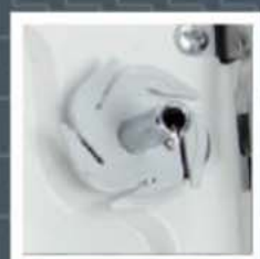
BOBBIN WINDER PLATE WITH CUTTER