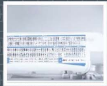
240 BUILT-IN STITCHES