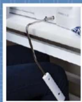
ERGONOMIC KNEE LIFT