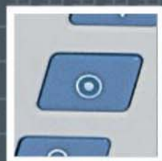
LOCK STITCH BUTTON