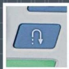
EASY REVERSE BUTTON