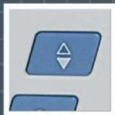
MEMORISED NEEDLE UP/DOWN